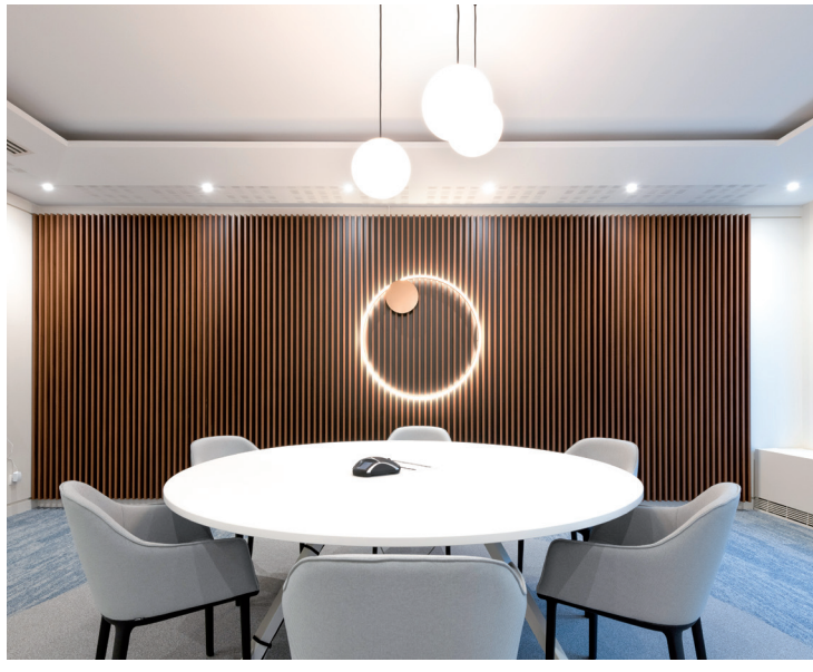
BOOK YOUR MEETING ROOM NOW!